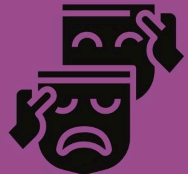
Acts of omission